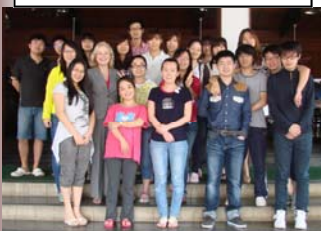
Tax Students in Malaysia