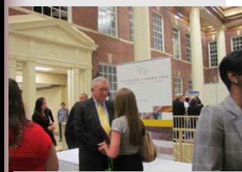
Meet the Firms in New Atrium Area

We encourage alumni to come by for a visit anytime you are in the area. We would love to give you a tour of the building.