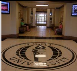
Front Door View