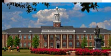
Bibb Graves Hall